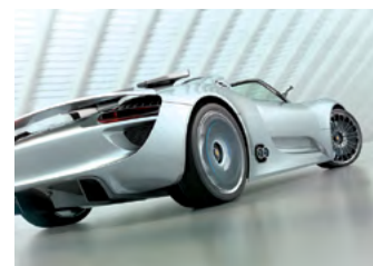
Automotive & Product Design