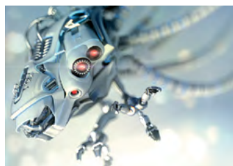
Film & Visual Effects

Explore the new key features of V-Ray 2.0 and experience faster interactive rendering process